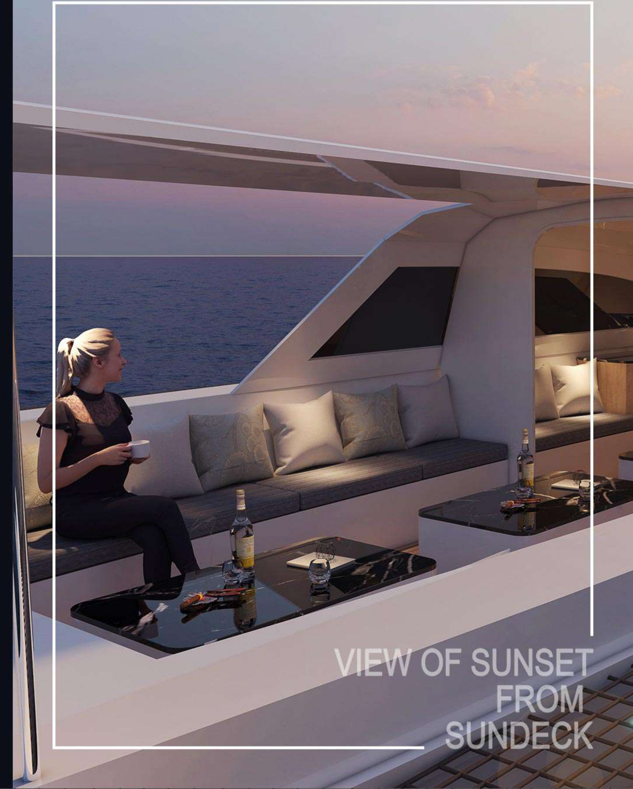
VIEW OF SUNSET FROM SUNDECK